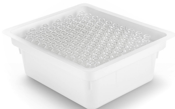
NEST & TUB