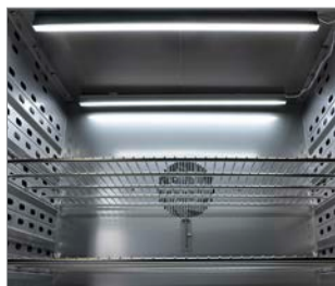
LED light strip sets