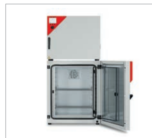
Flexible, mixed stacking options