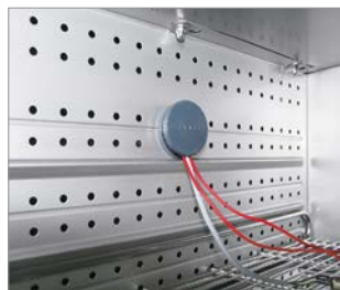
Access port with silicone plug