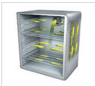
Homogeneous temperature distribution