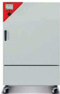
Model KB 240