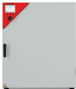
Model KT 170